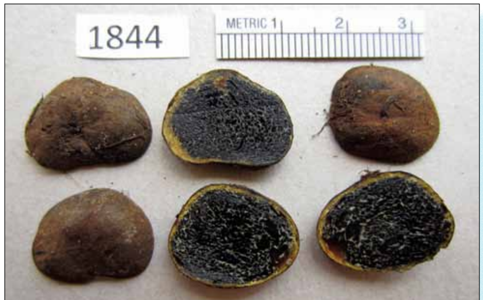
Figure 2. Melanogaster sp. (JLF1844).